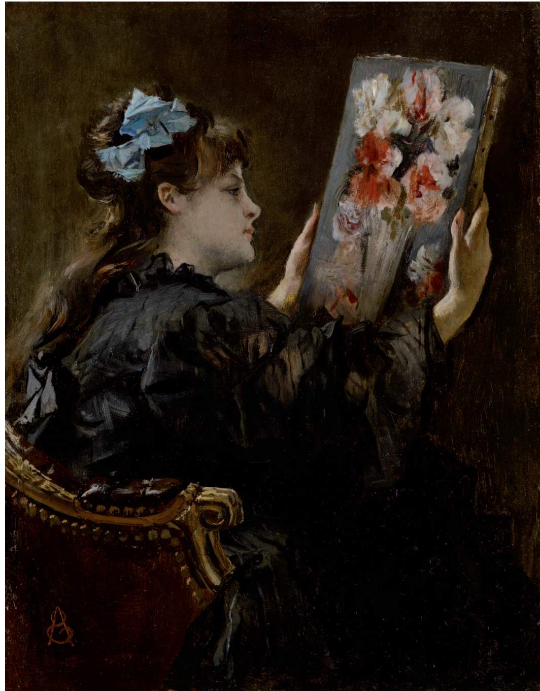
Alfred Stevens (1823-1906) An Élegante Holding a vase of Flowers

oil on panel signed with monogram 8¾ x 6¾in (22 x 17cm)