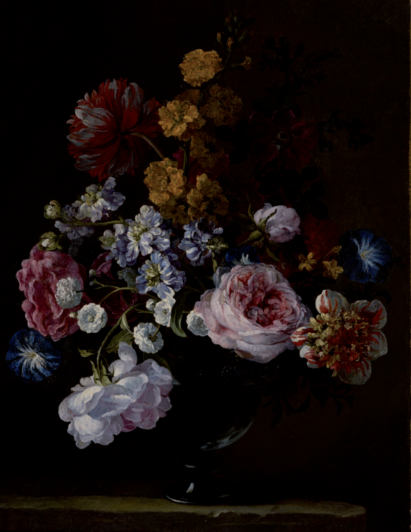
Jean-Baptiste Monnoyer (1634-1699) Flowers in a Glass Vase