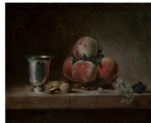
Jean-Siméon Chardin (1699-1779)

Still Life with Peaches, a Silver Goblet, Grapes and Walnuts